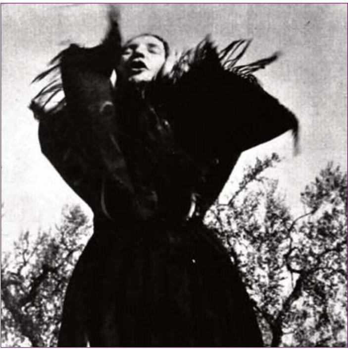
Figure 2. This photo depicts the rite of funeral weep, widespread in the farmer's world of southern Italy. To honor their dead, women gathered and wept with a special technique. Here the woman weeps in the countryside of Pisticci (Basilicata).