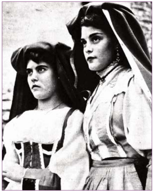
Figure 1. Two young peasants of Basilicata with their typical costumes.

For twenty years, RAI Teche, the RAI structure of Italian Broadcast that includes all the RAI archives, has been committed to bringing to the attention of an ever-wider public the most representative components of the historical, social, and cultural evolution of our country in its collections.