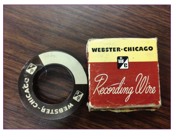
Figure 5: Ruby Spool.

But it is the last box of wire recording I put on the machine that is one of the most fascinating. On the box is written May 20, I 950, August 30, I 950. Jack & Aggie Mamage[sp?] – Used not good. On the actual spool is written Ruby.