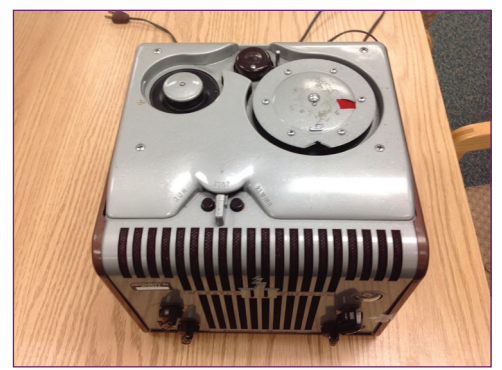
Figure 1: Webster-Chicago Electronic Memory Wire Recorder, Model 81-1.

Our wire recorder is a Webster-Chicago Electronic Memory wire recorder, model 81-1, and bears serial number 104946. This model was made to be positioned on a desk and for dictation use. There is no carrying case for it yet the machine is in mint condition. A little research about the machine revealed that the wire recorders manufactured by the Webster-Chicago