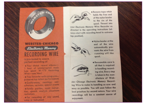
Figure 2: Wire Recorder Pamphlets.

Very thin stainless steel wire, about .0002 of an inch in diameter according to a leaflet in one of the boxes; the wire and housed on three sizes of spools - quarter hour, half hour and I hour sizes. The wire is tensile strength of 245,000 pounds per square inch for a single strand again according to the leaflet. The wire travels past a recording head that moved vertically and rhythmically at a speed of 24 inches per second. The spools, although only 2 ^3 /4" in width, are heavy. The quality of the recording was reported as very lifelike. One of the problems with the wire is that it would snarl and get tangled and prove almost impossible to untangle. I experienced this first hand with one of our wire recordings.