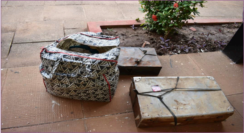
Figure 3. The metal boxes popularly referred to as trunk in Ghana and a plastic bag where the documents are kept.

The documents in the containers include letters, court records, reports of commissions of enquiry, maps, audio recordings, and photographs. Some of these document sets are beyond the scope of this paper, but special attention will be paid to letters, reports, maps, write ups and audio-visual recordings.