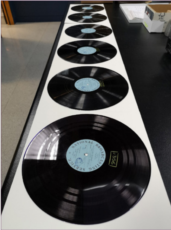
Figure 2. A cleaned series of discs ready for digitization.

The loss of plasticiser stresses the lacquer's structure leading to cracking, shrinking, and peeling away from the metal base. Capturing playback on a cracked record requires patience and good audio editing software. Sometimes the easiest solution is to continuously place the needle in different grooves and edit the audio together in post-production. The preservation principle of capturing as much audio as possible from a degrading disc must be kept in mind when this work is undertaken. A stray stylus needle in a crack can easily cause more damage, so drop-ins need to be calculated and precise. Revolutions per minute may also be reduced for more accurate capture before being processed back up to normal speed with editing software.