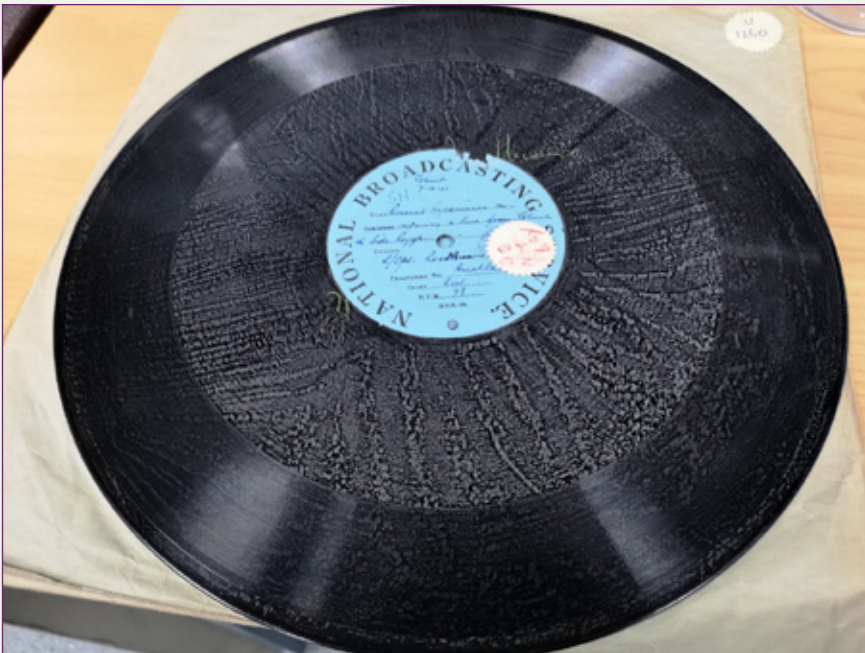
Figure 1. Disc suffering from palmitic acid, prior to cleaning [Sandy Ditchburn, Ngā Taonga Sound & Vision].

The aluminum (and occasionally zinc or steel) base of these lacquer transcription discs is coated in a thin layer of cellulose nitrate lacquer. Tracks were cut into this lacquer by a recording engineer using a lathe fixed in the back of a modified van or on a portable 'Presto' disc recorder. Although the manufacturing origins of these discs are unknown, it is suspected that they were sourced from different companies, which would explain the discrepancy in base materials. The composition of the lacquer includes a plasticiser that was used to soften the cellulose nitrate and reduce surface noise. However, over time this plasticiser exudes from cellulose nitrate in the form of palmitic acid, stearic acid, or lauric acid, depending on the plasticiser used. The acidic surface can eat away at the lacquer and have the opposite effect of increasing surface noise. It is not uncommon to pull out a disc for digitisation and find the surface covered in white crystals and fatty deposits associated with this type of decomposition (Figure 1). After the disc is spun through a diluted detergent solution in an ultrasonic cleaner to help loosen and remove any dust or grime, ammonia hydroxide is wiped over the grooves of the affected discs to clean off any acidic deposits. The label in the centre of the disc, which carries important information, is protected during this cleaning process (Figure 2).