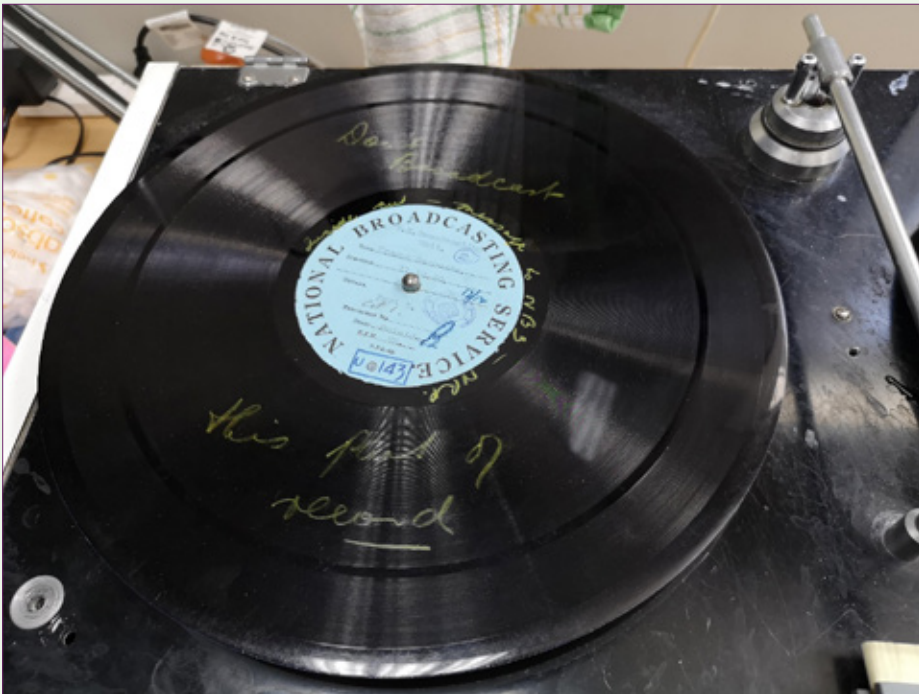
Figure 3. Disc with chinagraph pencil instructions for broadcasters.

sections of audio. In this case, the audio is captured using the same process that is used for cracked discs. When these discs are recorded to a digital format, every part of the audio is captured, regardless of the quality or fidelity of the original audio and, as these recordings were happening in the middle of a war zone or desert, the recording quality is, at times, decreased.